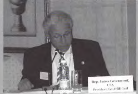
Rep. Jim Greenwood (USA), President, GLOBE International addressing PGA Clean Air/Clean Water Workshop, Johannesburg, South Africa, August 2002