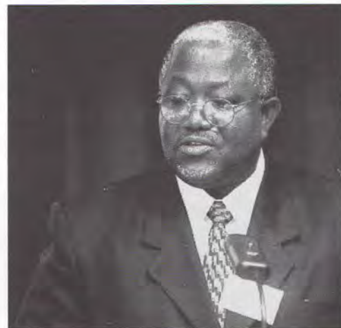
Parliament of Mali and ECOWAS Parliament in Abuja, Nigeria with great success.

The Johannesburg Workshop was a great success as it gathered together some 150 participants over the course of two days and resulted in a declaration calling for effective national legislation to reduce air and water pollution. The Sustainable Development & Population Program has also continued its Junior Professional Program in West Africa at the