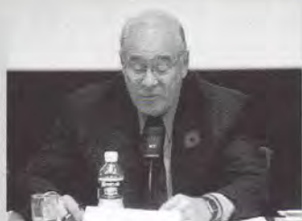
Hon. Dan Hays , Speaker of the Senate (Canada)