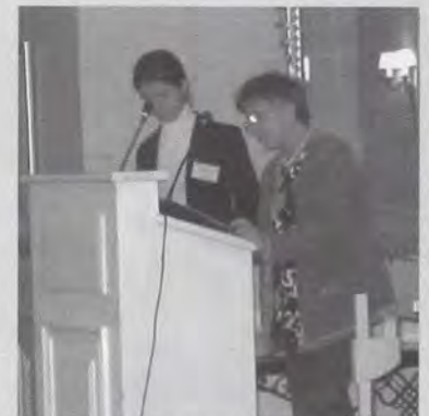
Ms. Asya Manafova, MP (Azerbaijan) at PGA Clean Air/Clean Water Workshop, Johannesburg, South Africa (August 2002)