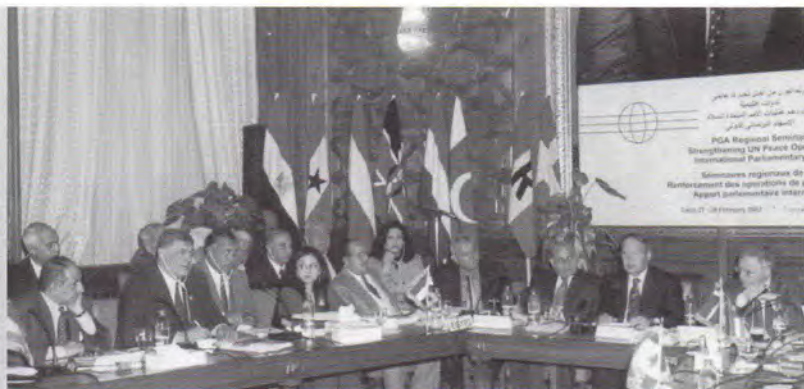
PGA Regional Seminar on Strengthening UN Peace Operations, Cairo, Egypt (February 2002)