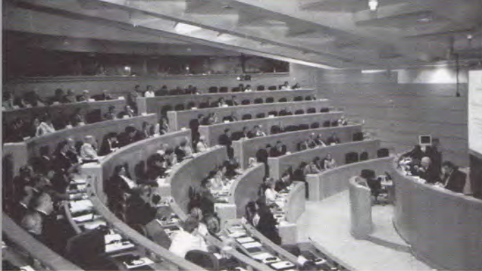
PGA Conference in Madrid, Spain (June 2002)