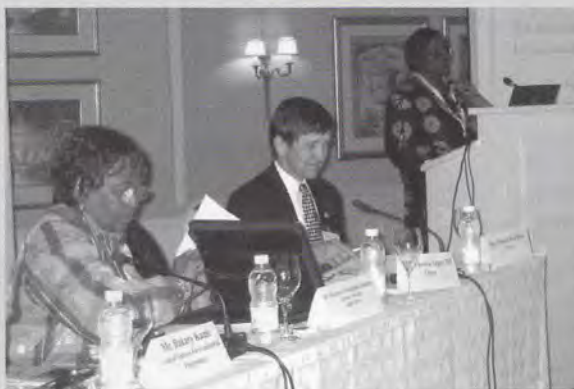
PGA Clean Air/Clean Water Workshop, Johannesburg, South Africa (August 2002); Dr. Manto E. Tshabalala-Msimang, Minister of Health (South Africa); Rep. Dennis Kucinich, (USA) Deputy Convenor, Sustainable Development and Population Program, PGA; Hon. Theresa Ameley Tagoe, Deputy Minister of Works and Housing, MP (Ghana), Convenor, Sustainable Development and Population Program, PGA

The workshop has resulted in a declaration calling for effective national legislation to reduce air and water pollution. The participants agreed that legislators everywhere can address global issues of energy consumption, water and sanitation by tackling pollution problems at home. Lack of political will and effective governance were acknowledged to be the main obstacles to successful implementation of laws governing pollution. Good governance also emerged as an