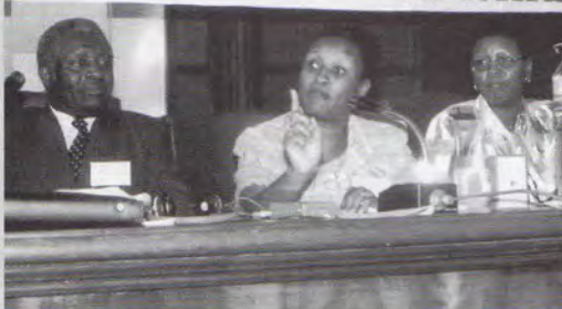
PGA Sub-regional Seminar on Capacity Building for Parliamentary Committees on Security Issues, Tanzania (September 2002);

NATIONAL AGENCY MINISTRY OF FOREIGN AFFAIRS