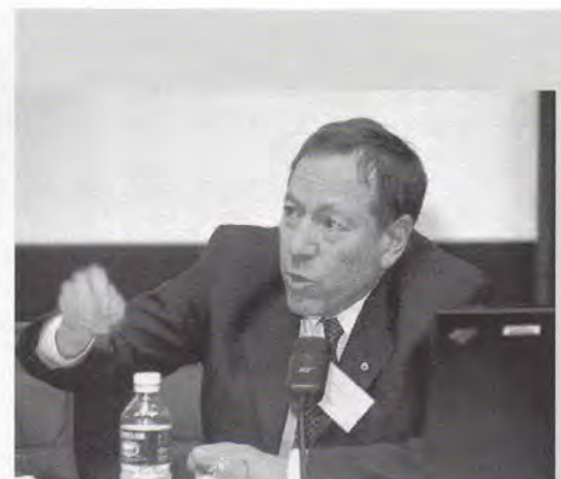
Prof. Irwin Cotler , MP (Canada), Chair of PGA Canadian National Group