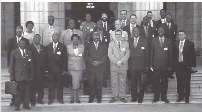
Participants of PGA Regional Seminar on Strengthening UN Peace Operations, Cairo (February 2002)

As a part of its peacebuilding work, PGA also conducted a series of regional parliamentary seminars on the United Nations Peace Operations in Ghana, Egypt and India from