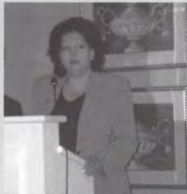
Ms. Hermine Naghdalyan, MP (Armenia) at PGA Clean Air/Clean Water Workshop, Johannesburg, South Africa (August 2002)