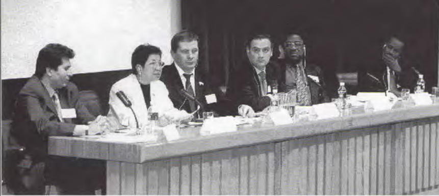
(l-r) Mr. Fatmir Mediu, MP (Albania); Ms. Loretta Ann Rosales, MP (Philippines); Mr. Mikhail Grishankov, MP (Russian Federation), Sen. Alfredo Prada Presa, Vice-President of the Senate (Spain); Hon. Amos Wako, MP, Attorney General & Minister of Justice (Kenya); Sen. Yoshitake Kimata (Japan); Mr. Martin Sindabizera, MP (Burundi)