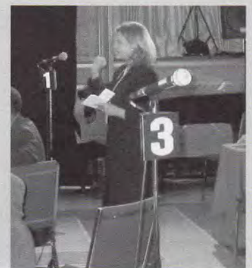
PGA at ICPD Conference, Ottawa, Canada (November 2002) Rep. Carolyn Maloney , (D-USA)