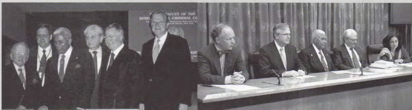
ICC Ratification Ceremony (11 April 2002)

The first of the three sub-regional and international parliamentary conferences on the ICC