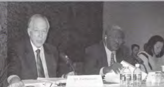
PGA Informal Briefing with the Security Council, G-77 and UN officials, May 2002;