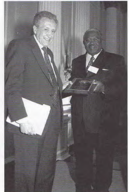
H.E. Mr. Lakhdar Brahimi , Special Representative of the UN Secretary-General to Afghanistan; Hon. Kenneth Dzirasah , President of PGA, Second Deputy Speaker (Ghana)