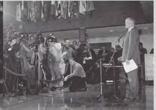
Pressconference with Hon. Bill Graham, Minister of Foreign Affairs (Canada)