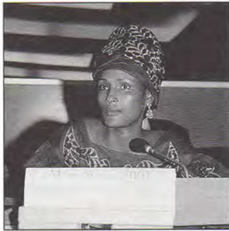
PGA's Second Annual Workshop, 'Five Years After Cairo: Where are we now?' - April 19-21, 1999 Dakar, Senegal. Mme. Waris Dirie, Goodwill Ambassador (UNFPA).

goals. The meeting was held on March 26, 1999 at the United Nations Headquarters in New York.