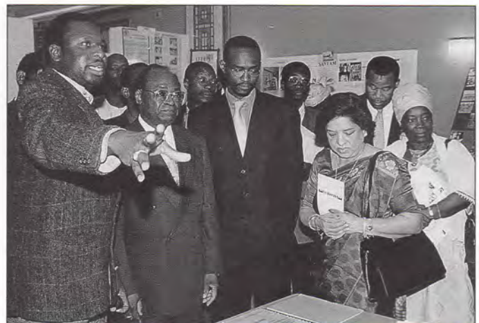
PGA's Second Annual Workshop, 'Five Years After Cairo: Where are we now?' - April 19-21, 1999 Dakar, Senegal. L-R: second from left, Mr. Cheick Abdoul Khadre Cissokho, Speaker of Senegal's National Assembly; Min. Ibrahima Sall, (Senegal), Minister of Planning; Dr. Nafis Sadik, Executive Director, United Nations Population Fund.