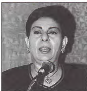
Fourth Annual Defender of Democracy Awards Ceremony September 29, 1999. Awardees, Top: Mr. John Hume, MP, MEP (Northern Ireland); Bottom: Dr. Hanan Mikhail-Ashrawi, Founder of the Palestinian Initiative for the Promotion of Global Dialogue and Democracy (MIFTAH).