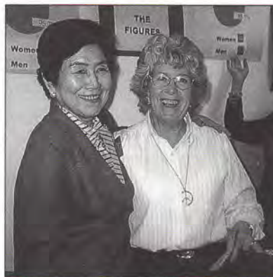
The Hague Appeal for Peace 'If Women Ruled the World' panel - May 13, 1999, The Hague, The Netherlands. L-R: Ms. Takako Doi, MP (Japan); Dr. Maj Britt Theorin, MEP (Sweden), PGA Executive Board Member

"Women find a way of [solving a conflict], of discussing it in another way... There are lots of women in the world and they should be at the negotiation table today to solve the conflict!" declared Dr. Maj Britt Theorin, MEP (Sweden), and co-moderator of the intensive dialogue between parliamentarians, civil society activists, and audience participants during "If Women Ruled the World," a panel PGA co-organized with the Women's Environment and Development Organization (WEDO) during the Hague Appeal for Peace