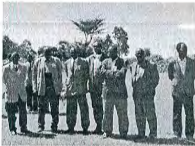
Men who have accepted change