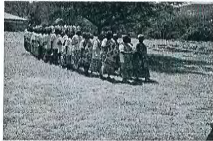
Initiators and initiates during graduation