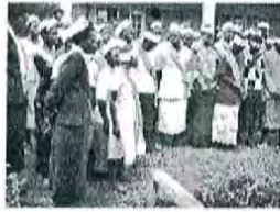
Graduation of girls from Tumndo Ne Leel Program