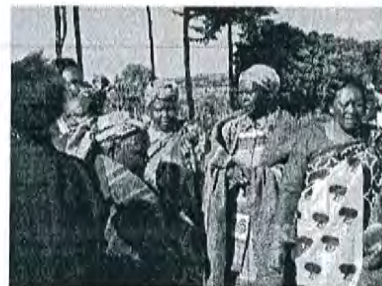
Saying thank you to initiators and guests