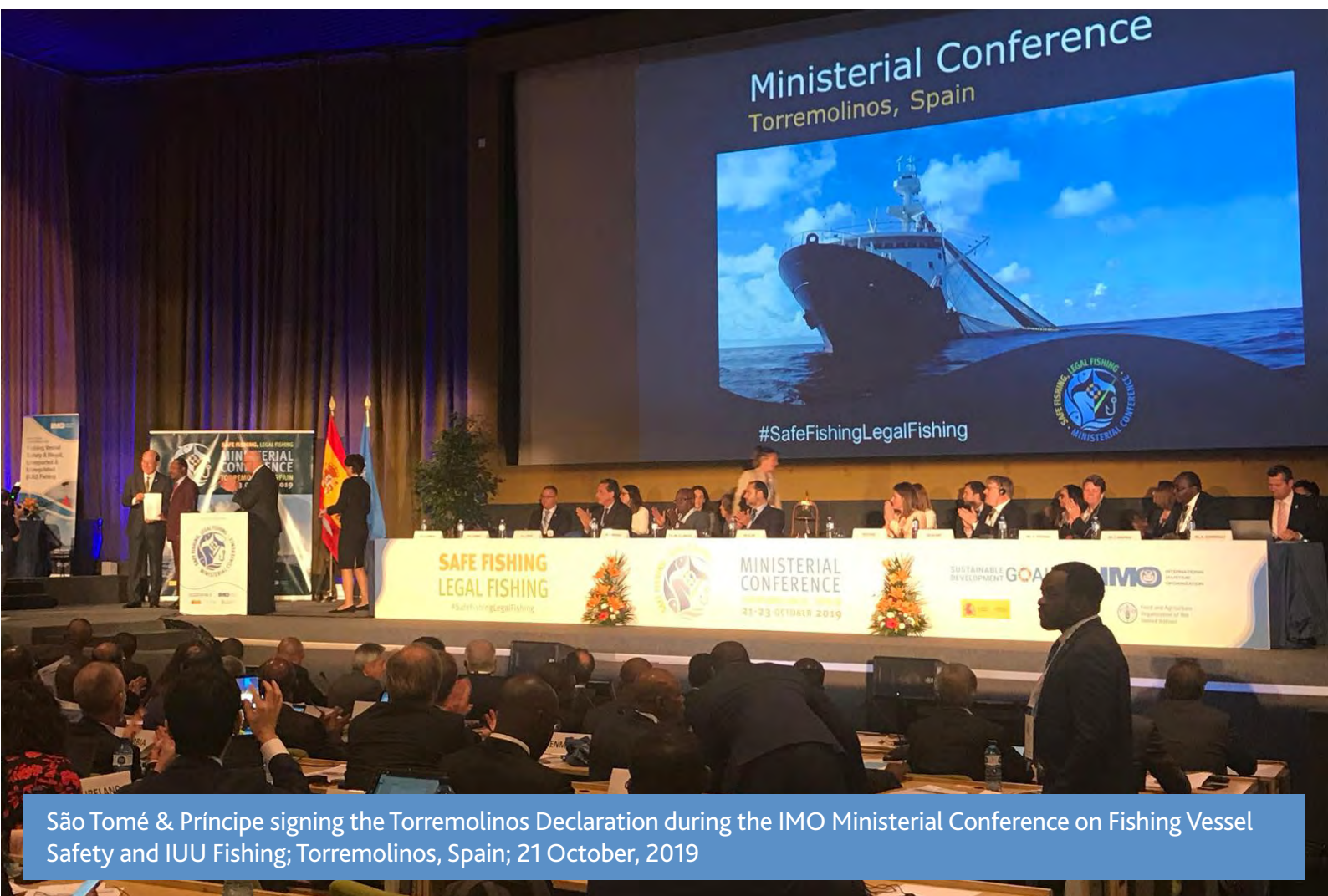
São Tomé & Príncipe signing the Torremolinos Declaration during the IMO Ministerial Conference on Fishing Vessel Safety and IUU Fishing; Torremolinos, Spain; 21 October, 2019