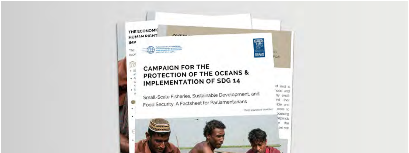
Small-Scale Fisheries Factsheet ( en ) 41 ( es ) 42