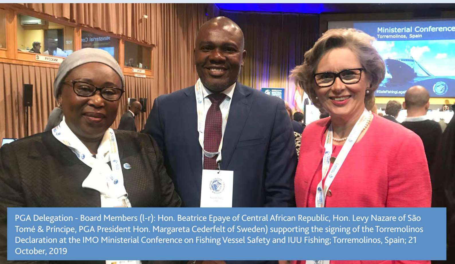
PGA Delegation - Board Members (l-r): Hon. Beatrice Epaye of Central African Republic, Hon. Levy Nazare of São Tomé & Príncipe, PGA President Hon. Margareta Cederfelt of Sweden) supporting the signing of the Torremolinos Declaration at the IMO Ministerial Conference on Fishing Vessel Safety and IUU Fishing; Torremolinos, Spain; 21 October, 2019