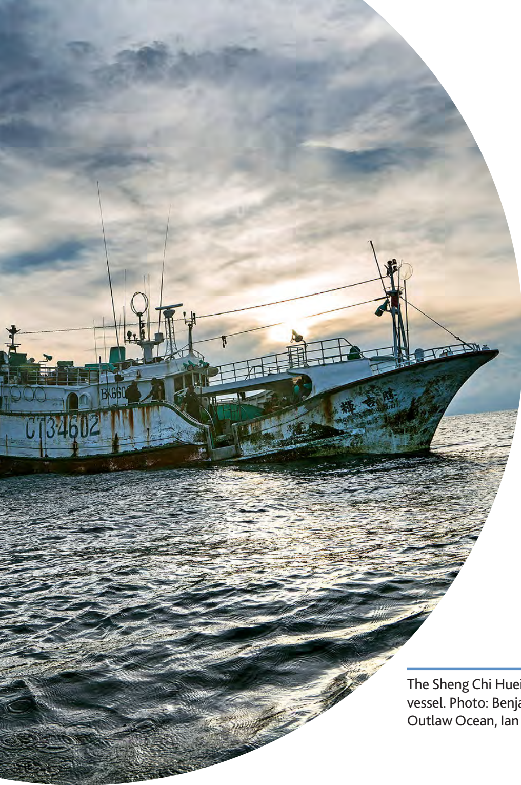
The Sheng Chi Huei 12, a Taiwanese fishing vessel. Photo: Benjamin Lowy/Reportage; The Outlaw Ocean, Ian Urbina, The New York Times