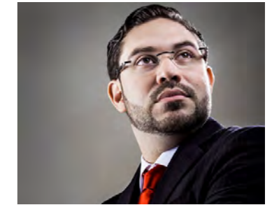
Dip. Jorge Calix Honduras