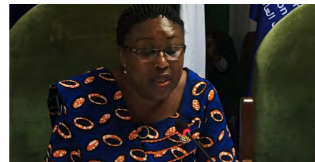
DEP. EMILIE B  ATRICE EPAYE, CENTRAL AFRICAN REPUBLIC

The BWC/1540 Campaign was launched in 2015 at PGA's 37 th Annual Forum on the Role of Parliamentarians in Support of Peace and Security in San Salvador, El Salvador. While the BWC was the first multilateral disarmament treaty banning the production of an entire category of weapons in 1972, it still has no mechanism of verification. Until a verification mechanism can formally be put in place, PGA believes that parliamentarians, have an essential, but under-utilized, role to play in addressing this challenge.