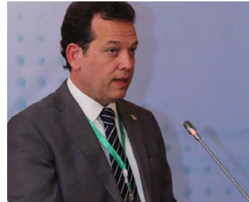
Dip. Victor Orlando Bisonó Dominican Republic Chair of International Council