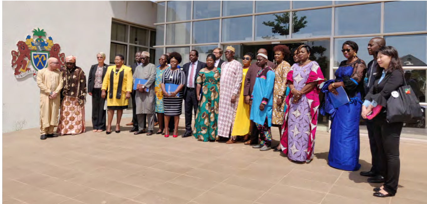
NATIONAL ASSEMBLY OF THE GAMBIA IN BANJUL - MAY 16-17, 2019

PGA also held a Regional Caribbean Workshop on Biological Security Frameworks in St. Vincent and the Grenadines in Kingstown on October 14. The event helped familiarize members of the Executive and Legislative branches of government from 4 countries in the region with regional and international biosecurity frameworks, particularly from a public health perspective. Lastly, in December, PGA organized a parliamentary delegation from Somalia to attend the Annual Meeting of States Parties (MSP) to the BWC at the United Nations in Geneva, Switzerland. The State Minister in the Office of the Prime Minister of Somalia, Hon. Abdullahi Hamud Mohamed, later announced the government's intention to move forward with ratification of the BWC.