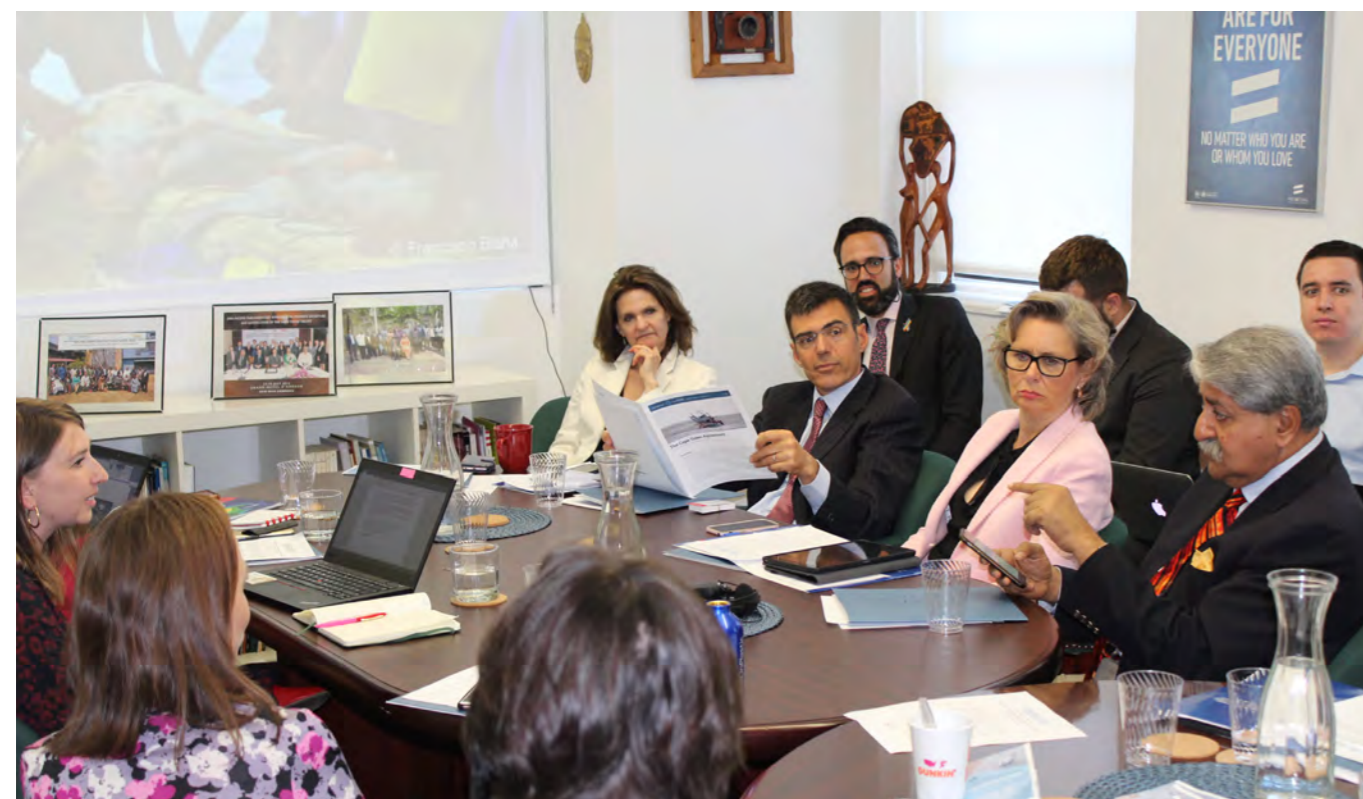
PGA ROUNDTABLE DISCUSSION AND TRAINING ON THREE INTERNATIONAL TREATIES TO ADDRESS ILLEGAL, UNREPORTED, AND UNREGULATED (IUU) FISHING, JULY 15, 2019.