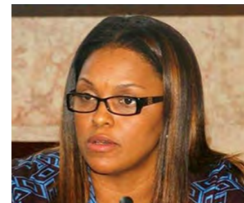
Dep. Dr. Suzi Barbosa Guinea-Bissau