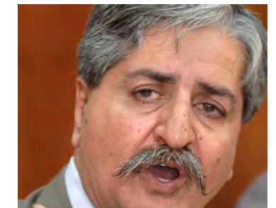
Hon. Syed Naveed Qamar, MP Pakistan