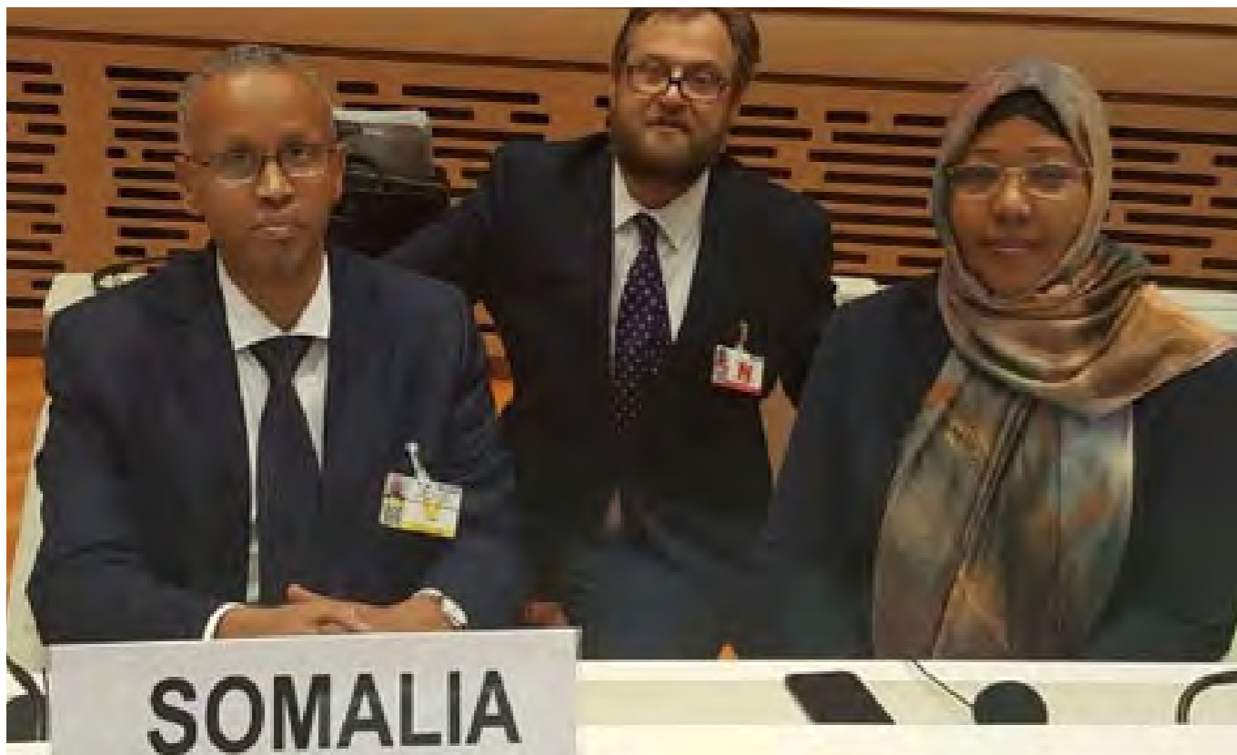
DELEGATION FROM SOMALIA TO ATTEND THE ANNUAL MEETING OF STATES PARTIES (MSP) TO THE BIOLOGICAL WEAPONS CONVENTION (BWC) IN GENEVA DEC 3-6, 2019

PGA also held a Regional Caribbean Workshop on Biological Security Frameworks in St. Vincent and the Grenadines in Kingstown on October 14. The event helped familiarize members of the Executive and Legislative branches of government from 4 countries in the region with regional and international biosecurity frameworks, particularly from a public health perspective. Lastly, in December, PGA organized a parliamentary delegation from Somalia to attend the Annual Meeting of States Parties (MSP) to the BWC at the United Nations in Geneva, Switzerland. The State Minister in the Office of the Prime Minister of Somalia, Hon. Abdullahi Hamud Mohamed, later announced the government's intention to move forward with ratification of the BWC.