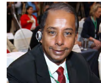
Hon. Kula Segaran, MP Malaysia