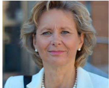
Ms. Margareta Cederfelt, MP Sweden President