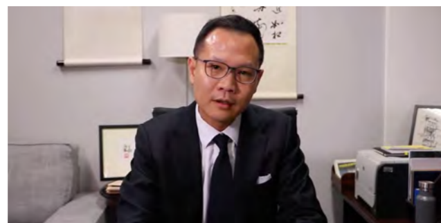
HON. DENNIS KWOK, HONG KONG LEGISLATIVE ASSEMBLY MEMBER

Finally, PGA has entered into new partnerships in support of the campaign. For the week of the International Day of Democracy, from 15 to 22 September, PGA shared 16 videos of parliamentary democracy defenders in partnership with the Democracy Decay & Renewal project, which received almost 1000 views on Twitter alone. PGA has also joined forces with the Raoul Wallenberg Centre for Human Rights (RWCHR), an international consortium of parliamentarians, scholars, jurists, human rights defenders, NGOs, and students united in the pursuit of justice.