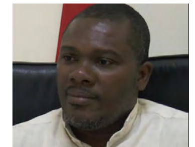
Dep. Levy Nazaré São Tomé and Príncipe