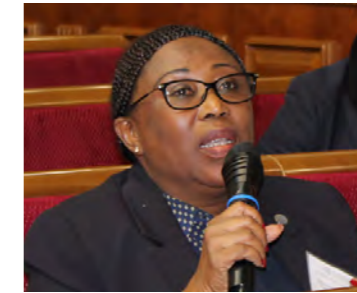
Dep. Emilie Béatrice Epaye Central African Republic