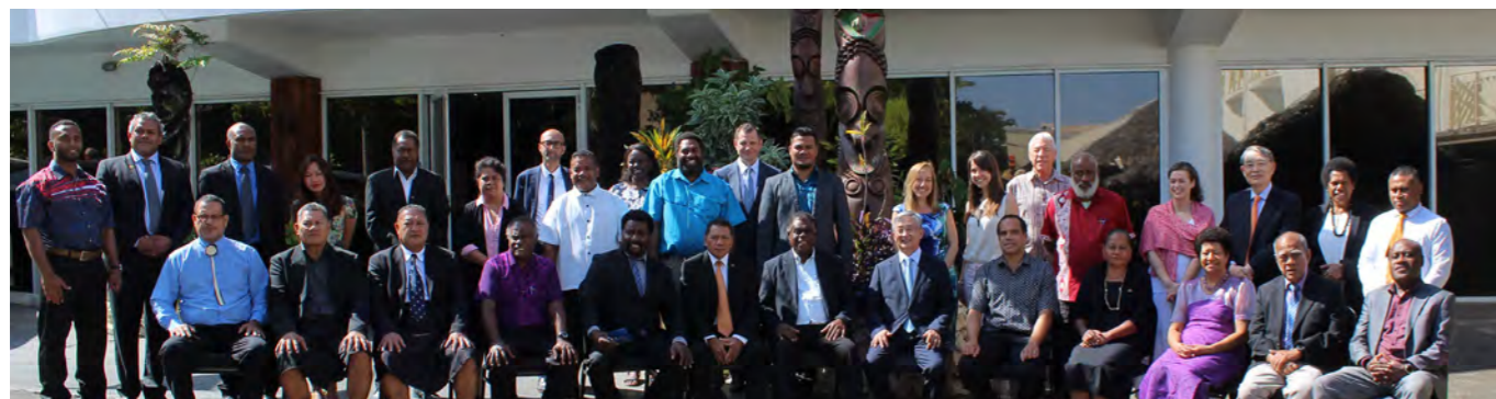
MAY 31, 2019: PACIFIC ISLANDS ROUNDTABLES ON THE RATIFICATION AND IMPLEMENTATION OF THE ROME STATUTE OF THE INTERNATIONAL CRIMINAL COURT (ICC), PORT VILA, VANUATU

As an example of PGA's efforts coming to fruition, Kiribati's accession drew on momentum generated by an interactive lunch panel on the "20th Anniversary of the Rome Statute of the ICC: Expanding ICC Membership in Pacific Island States" organized by PGA at the European Parliament in June 2018. The panel led to a Pacific Islands Roundtable convened by PGA with more than 40 parliamentarians, government representatives, and senior diplomats from 7 countries in Vanuatu in May 2019. Made possible thanks to the invaluable cooperation of the ICC, the Republic of Korea, and the European Union, the event served to dispel misconceptions, increase understanding, and generate political will to support the Rome Statute system in the Pacific region. PGA's National Groups in Uruguay and The Gambia also hosted regional working groups this year focused on the particular context, challenges, and opportunities of the fight against impunity in Latin America and Africa, respectively.