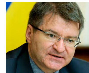
Dr. Hryhoriy Nemyria, MP Ukraine