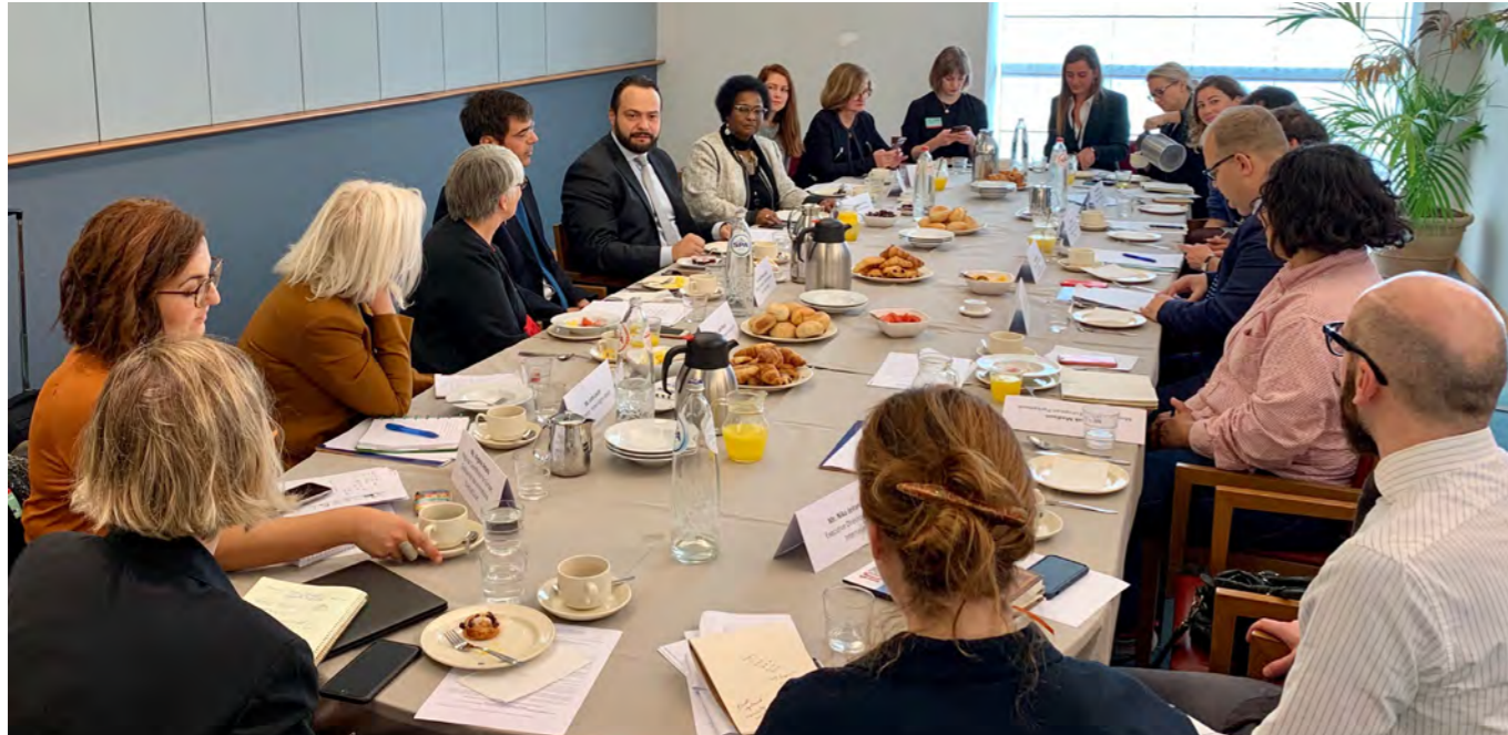
OCTOBER 2, 2019: PGA GROUP IN THE EUROPEAN PARLIAMENT MEETS TO DISCUSS THE EU ROLE IN THE FIGHT AGAINST IMPUNITY, BRUSSELS

the Rome Statute taken by a unanimous Cabinet of Ministers at end of 2018. PGA members fought back against attacks on the ICC, including the U.S. administration's placement of visa restrictions on senior Court officials. At the same time, many ICC supporters were led to question its efficacy in the fight against impunity in light of the latest high profile acquittals and decision not to open a preliminary examination into alleged crimes committed during the U.S./Afghanistan conflict.