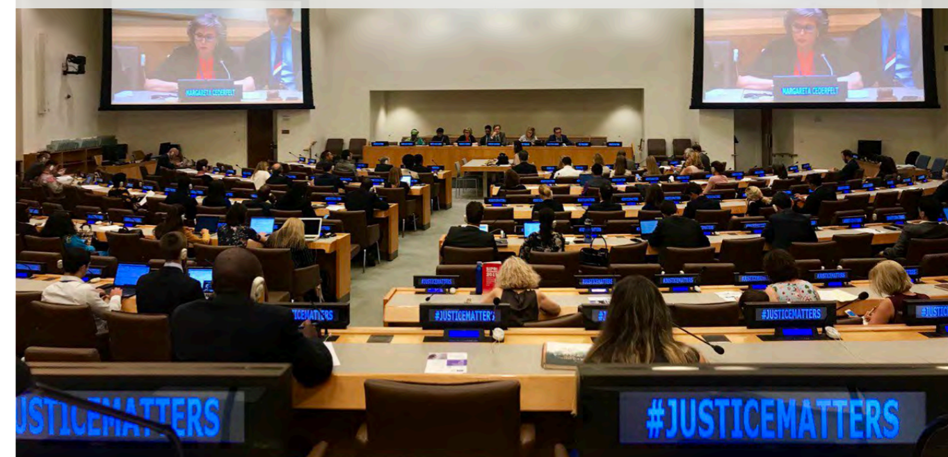
JULY 17, 2019: SIDE EVENT TO THE HIGH-LEVEL POLITICAL FORUM (HLPF) 2019: THE CRUCIAL ROLE OF INTERNATIONAL CRIMINAL JUSTICE IN ACHIEVING SDG16, CO-ORGANIZED BY THE PERMANENT MISSION OF LIECHTENSTEIN TO THE UNITED NATIONS AND PGA, UNITED NATIONS, NEW YORK

This year, there were promising early signs of potential justice for victims of atrocities for whom PGA members have been staunch advocates , such as the ICC's opening of an investigation into alleged crimes against the Rohingya people in Myanmar. PGA joined with NGO partners to support the right for victims to participate in ongoing International Court of Justice (ICJ) proceedings brought by The Gambia against Myanmar under the Genocide Convention. Additionally, after repeated demands for his surrender , PGA welcomed the arrest of former Sudanese president Omar al-Bashir and called for the interim government to cooperate with the ICC to bring him to justice. In a pivotal decision regarding the failure of Jordan to arrest Bashir when he travelled to an Arab League summit in Amman while President of Sudan, the Appeals Chamber of the ICC unanimously re-affirmed that sitting Heads of States do not have immunity from arrest when they travel to States bound by the Rome Statute, UN Security Council resolutions, and customary international law to honor the Nuremberg trial's principle of irrelevance of official capacity.