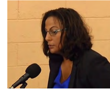
Sen. Valerie Woods Belize