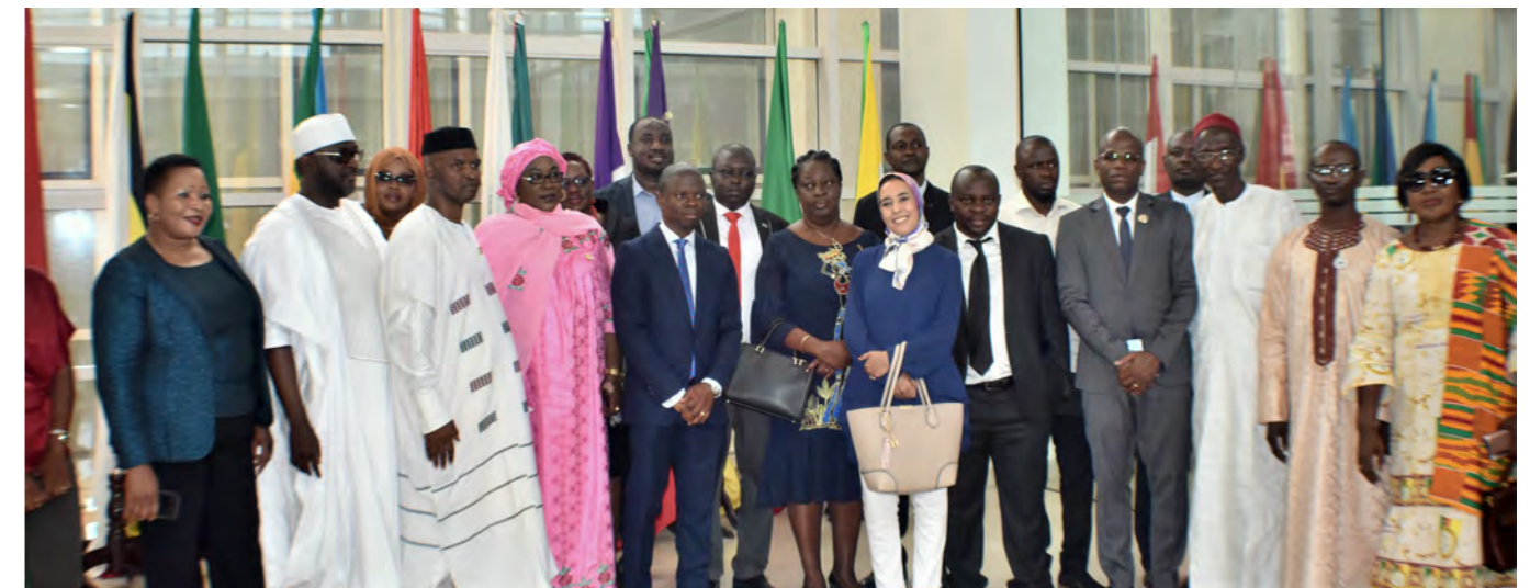
REGIONAL WORKING GROUP ON THE FIGHT AGAINST IMPUNITY IN AFRICA: DEVELOPING ACCOUNTABILITY MECHANISMS AND THE EFFECTIVE IMPLEMENTATION OF THE ROME STATUTE OF THE ICC, PARLIAMENT OF THE GAMBIA, BANJUL, MAY 16-17, 2019.

These developments typified PGA's sustained and focused approach, which this year included activities on five continents where parliamentarians took critical steps to realize the goals of ratification, implementation legislation, and cooperation agreements under the Rome Statute system, committing themselves and their countries to both shared and concrete country-specific goals.