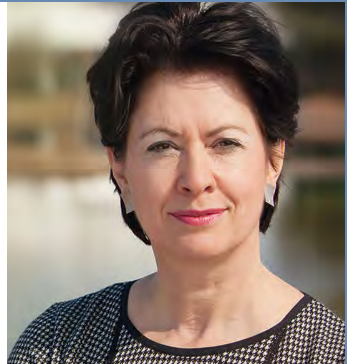
MS. BARBARA LOCHBIHLER, MEP (GERMANY)

Another notable step on the universality of the Rome Statute took place in Haiti , where PGA's long-term engagement resulted in a commitment by the Minister of Foreign Affairs in July 2017 to move the country towards ratification. Furthermore, in 2017, the PGA Secretariat provided crucial legislative assistance to the Governments of Solomon Islands and Kiribati . Both Governments – together with the Government of Tuvalu – committed to join the Rome Statute system at the 48th Pacific Islands Forum.