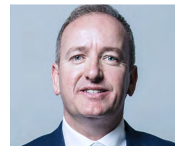
Mr. Mark Pritchard, MP, United Kingdom