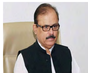
Shri Tariq Anwar, MP India