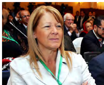
Dip. Margarita Stolbizer Argentina President of PGA