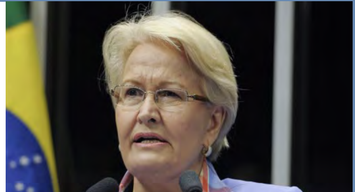
SEN. ANA AMELIA

During 2017, in continuity with the last four years of work, PGA Members in Brazil in both the Chamber of Deputies and the Senate made a number of decisive contributions that ultimately led to Brazil's recent ratification of the Arms Trade Treaty in early 2018.