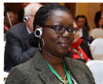
Ms. Ursula Owusu-Ekuful, MP Ghana