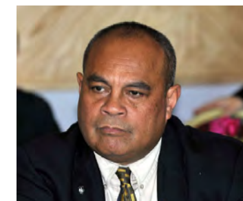
Mr. Su'a William Sio, MP New Zealand