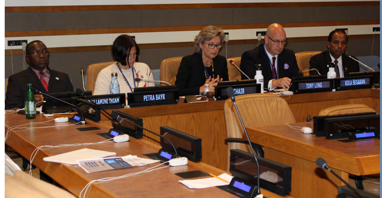
PICTURED (FROM LEFT TO RIGHT):

A particular focus of PGA's Campaign is to build political will for the national implementation of new international regulatory frameworks for that purpose. That, in turn, will create a more sustainable fishing and seafood industry that will contribute to greater food security, prevention of health problems, and reduction of marine pollution.