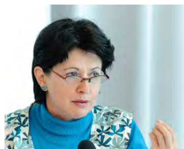
Ms. Barbara Lochbihler, MEP Germany European Parliament