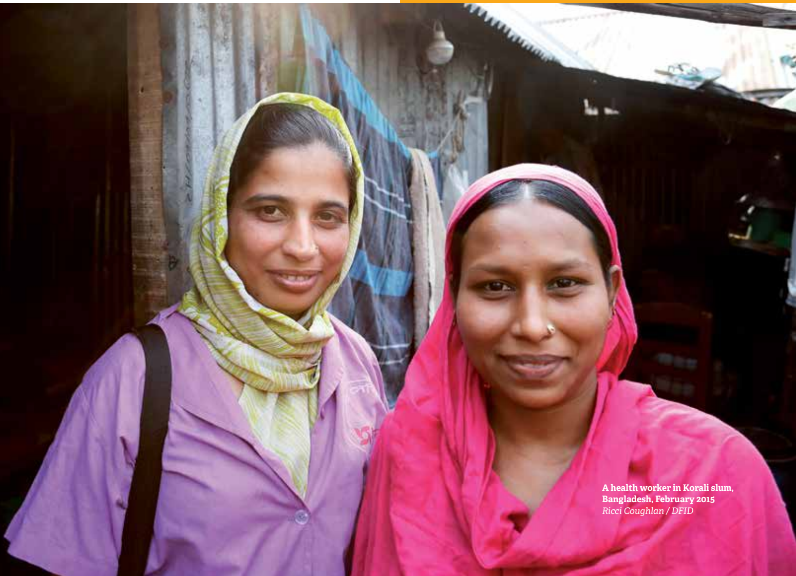
A health worker in Korali slum, Bangladesh, February 2015

The eight member countries of the South Asia Initiative to End Violence Against Children (SAIEVAC) – Afghanistan, Bangladesh, Bhutan, India, the Maldives, Nepal, Pakistan and Sri Lanka – have developed a Regional Action Plan to End Child Marriage in South Asia (2015-2018) . This action plan sets out clear regional and national strategic actions to address child marriage, with suggested activities and indicators outlined on how to achieve the plan's outcomes.