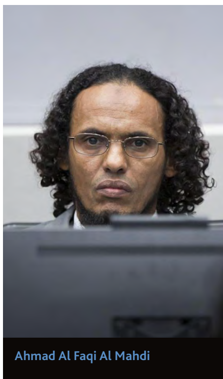
Ahmad Al Faqi Al Mahdi

On 27 September 2016, Trial Chamber VIII of the ICC delivered its Judgment in the case of The Prosecutor v. Ahmad Al Faqi Al Mahdi.