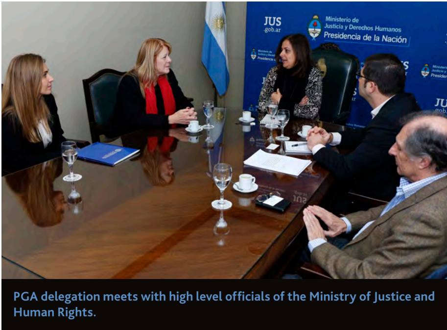
PGA delegation meets with high level officials of the Ministry of Justice and Human Rights.