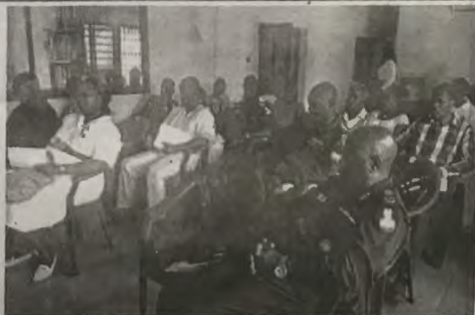
Questions and answers session formed part of the meeting