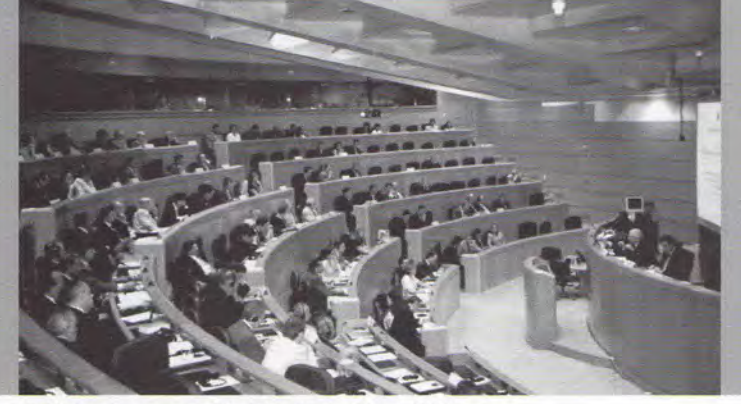
PGA Conference in Madrid, Spain (June 2002)