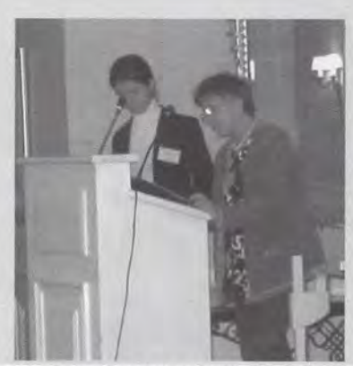
Ms. Asya Manafova, MP (Azerbaijan) at PGA Clean Air/Clean Water Workshop, Johannesburg, South Africa (August 2002)