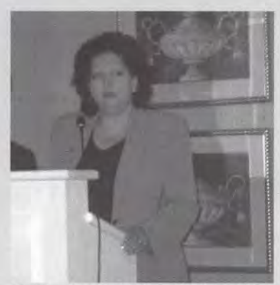
Ms. Hermine Naghdalyan, MP (Armenia) at PGA Clean Air/Clean Water Workshop, Johannesburg, South Africa (August 2002)