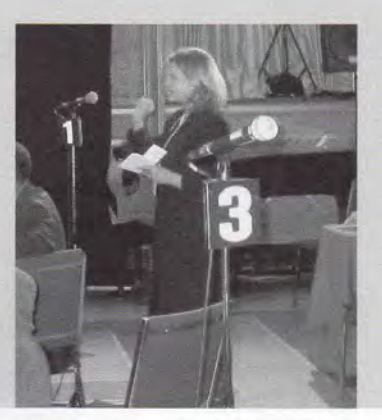
PGA at ICPD Conference, Ottawa, Canada (November 2002) Rep. Carolyn Malloney, (D-USA)