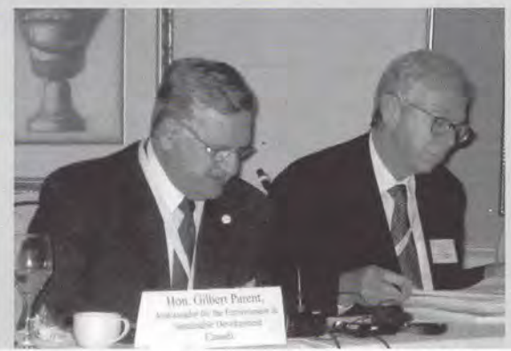
PGA Clean Air/Clean Water Workshop, Johannesburg, South Africa (August 2002);

Dr. Manto E.Tshabalala-Msimang, Minister of Health (South Africa); Rep. Dennis Kucinich, (USA) Deputy Convenor, Sustainable Development and Population Program, PGAI; Hon. Theresa Ameley Tagoe, Deputy Minister of Works and Housing, MP (Ghana), Convenor, Sustainable Development and Population Program, PGA