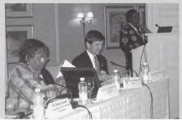
PGA Clean Air/Clean Water Workshop, Johannesburg, South Africa (August 2002);

The workshop has resulted in a declaration calling for effective national legislation to reduce air and water pollution. The participants agreed that legislators everywhere can address global issues of energy consumption, water and sanitation by tackling pollution problems at home. Lack of political will and effective governance were acknowledged to be the main obstacles to successful implementation of laws governing pollution. Good governance also emerged as an