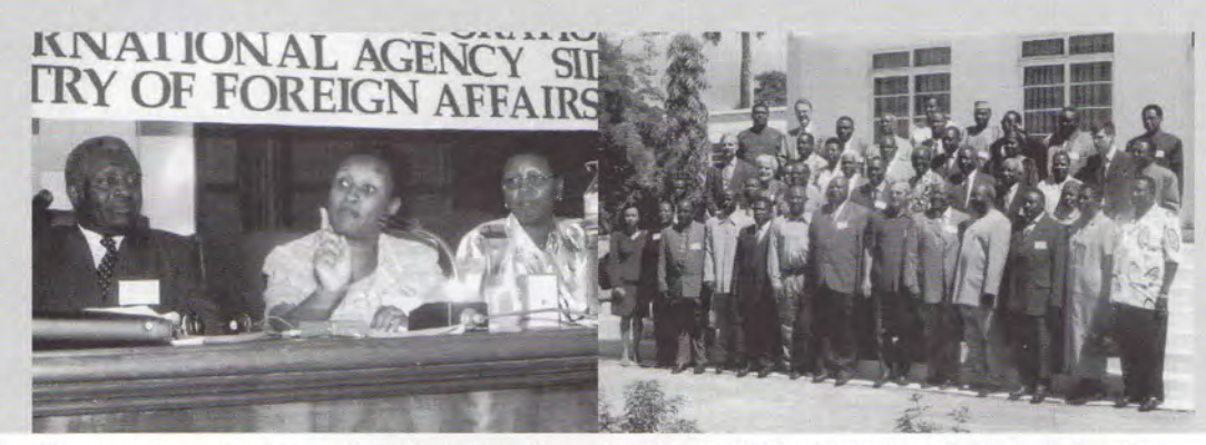
PGA Sub-regional Seminar on Capacity Building for Parliamentary Committees on Security Issues, Tanzania