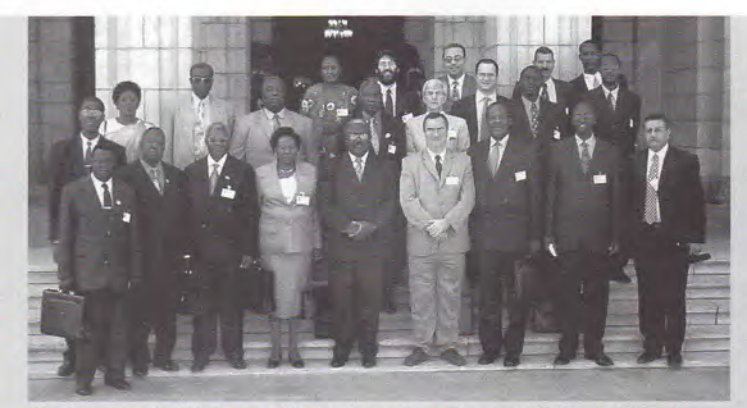
Participants of PGA Regional Seminar on Strengthening UN Peace Operations, Cairo (February 2002)

As a part of its peacebuilding work, PGA also conducted a series of regional parliamentary seminars on the United Nations Peace Operations in Ghana, Egypt and India from