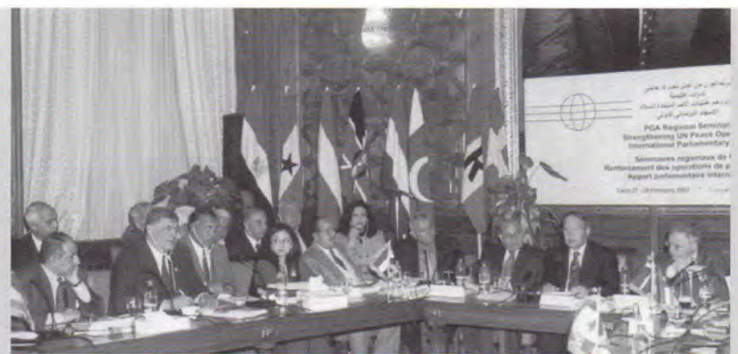
PGA Regional Seminar on Strengthening UN Peace Operations, Cairo, Egypt (February 2002)