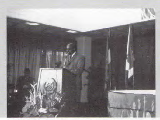
PGA Conference in Mauritius (May 2002) Hon. Premnath Ramnah, Speaker of the National Assembly (Mauritius)