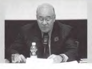
Hon. Dan Hays, Speaker of the Senate (Canada)