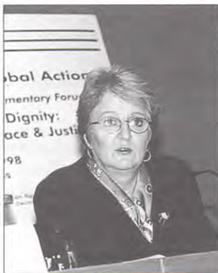
H.E. Louise Fréchette, UN Deputy Secretary-General.