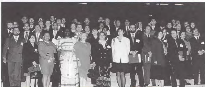
"Group Photo: Strengthening the Role of Parliamentarians in the Democratic Process," October 22-24, 1998, Valparaíso, Chile.