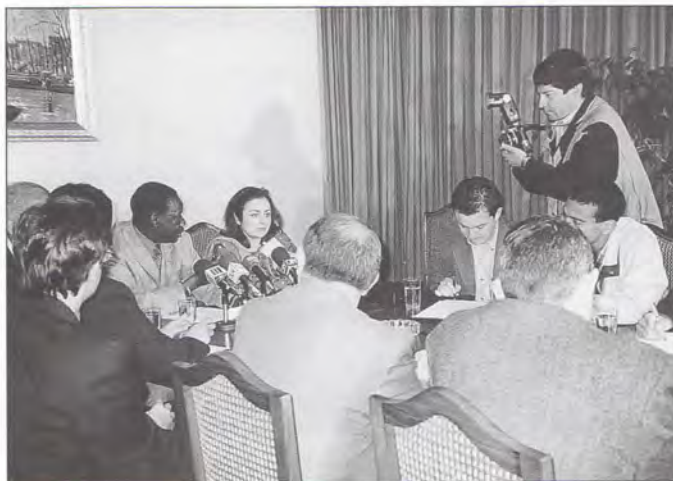
Press Conference: "Strengthening the Role of Parliamentarians in the Democratic Process," October 22-24, Valparaíso, Chile.

Hoy finaliza en el Congreso Nacional el Encuentro Interparlamentario que se está desarrollando con la participación de legisladores de diferentes países del mundo.