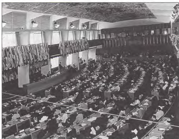
The ICC Conference in Rome.

In recent years, the widespread killings of civilians in Rwanda and Bosnia have highlighted the need for a permanent International Criminal Court. The Diplomatic Conference in Rome brought together governments