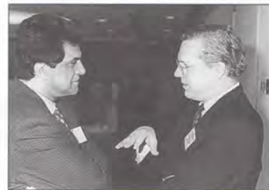
Trinidad and Tobago Workshop: Hon. Ramesh Maharaj, S.C., Attorney General of Trinidad & Tobago; Amb. David J. Scheffer, US Amb. at large for War Crimes.