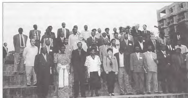
ABOVE: PGA delegation attends International Alert Meetings on "Women Parliamentarians and Peace-Building in the Great Lakes Region," February 9-10, 1998 and "Regional Conference on the Role of Parliamentarians in Conflict Prevention and Resolution," February 11-13, Kigali, Rwanda.