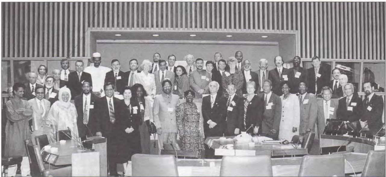
Group shot of participants at the 20th Annual Parliamentary Forum at the UN: Striking the Balance of Peace and Justice.