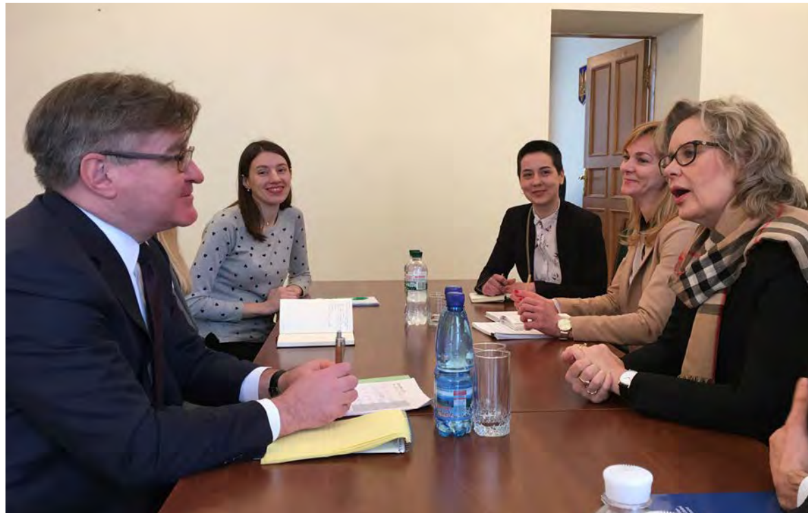
President of PGA meeting with Chair of the Ukrainian Human Rights Committee, 2018.

You can promote legislative measures to ensure: