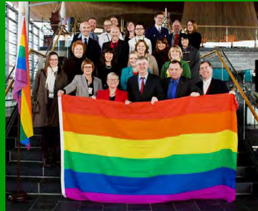
Welsh Parliament Members, LGBT Allies and the LGBT network raising the rainbow flag for LGBT History month.

North Macedonia: Inter-party group on LGBTI rights European Parliament: LGBTI Intergroup Poland: Polish Intergroup on LGBT+ rights United States: Congressional LGBTQ+ Equality Caucus United Kingdom: All Party Parliamentary Group (APPG) on Global LGBT+ Rights New Zealand: Parliamentary Rainbow Network