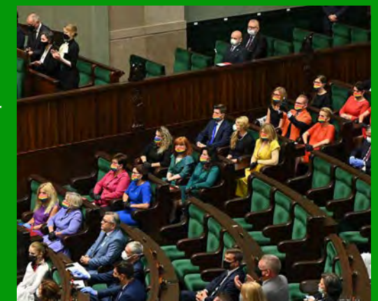
Polish MPs at President Duda’s inaugural ceremony, August 2020.