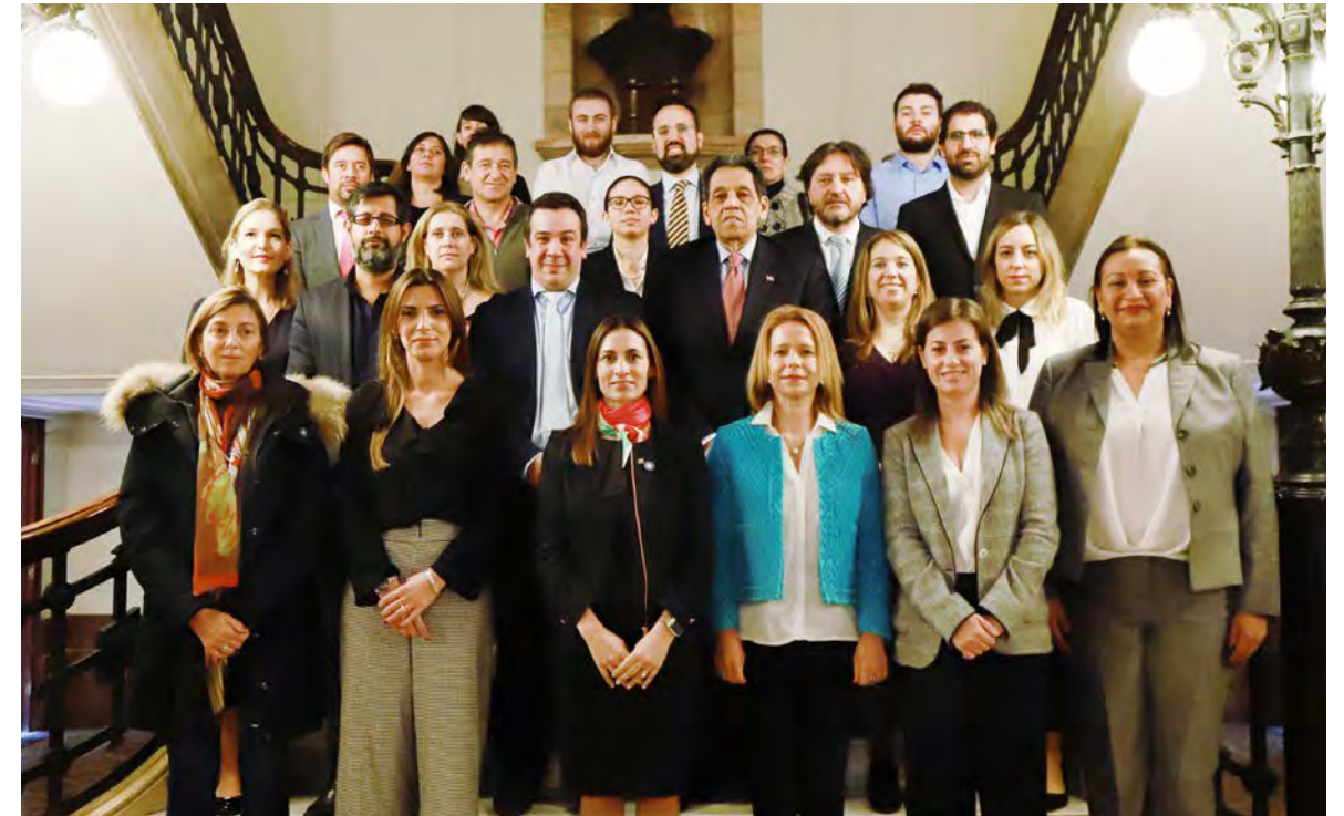
Seminar for Parliamentarians and National Human Rights Institutions on Equality and Non-Discrimination based on SOGI in Latin America and the Caribbean, Congressional Palace, Buenos Aires, Argentina, 2018.

See also section 7, "Stepping up in your own country" for broader actions you can take in your multiple roles as an MP.