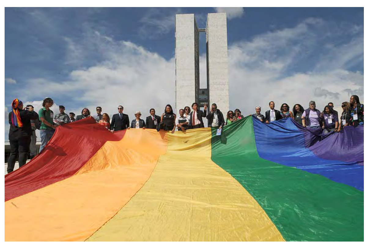
- LGBT Flag at the National Congress of Brazil.

55 IACHR, Advisory Opinion 24/2017 on gender identity, and equality and non-discrimination of same-sex couples, 2017