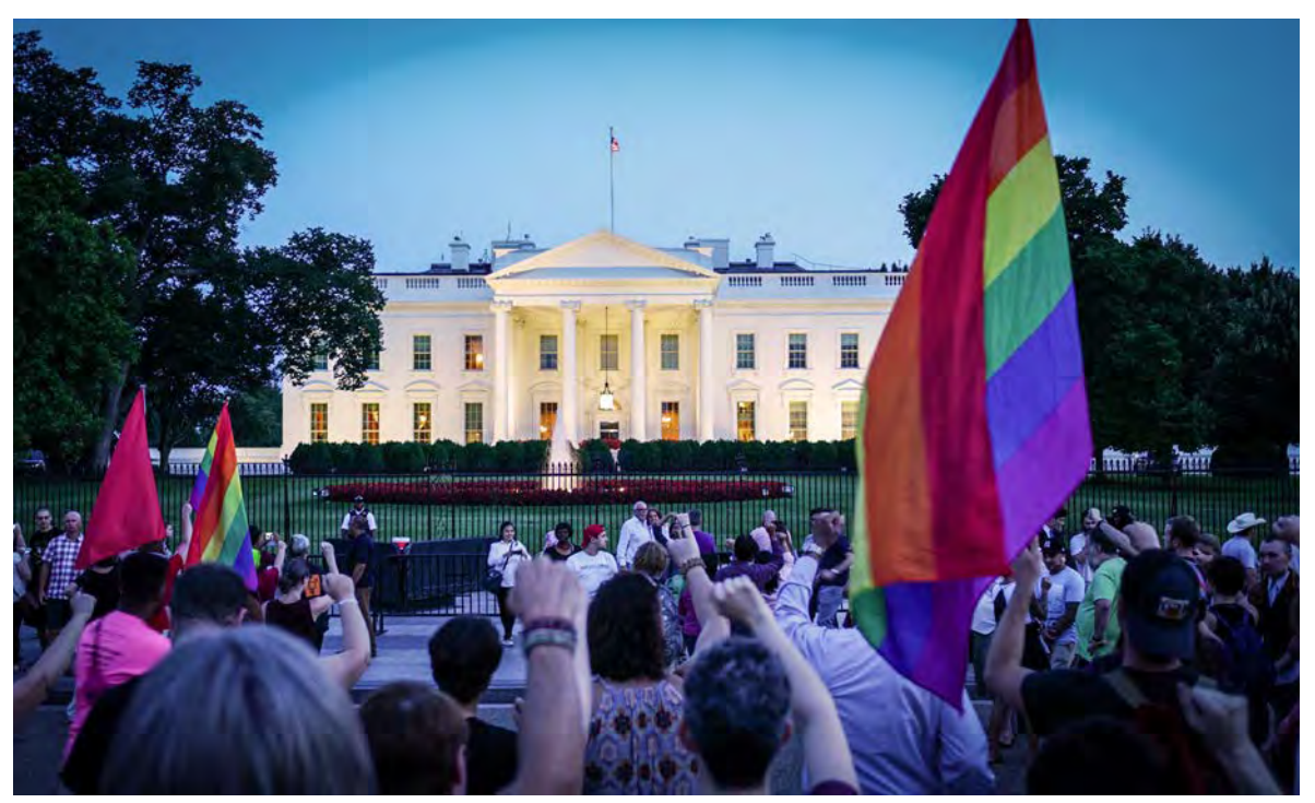
Protest against military transgender ban in 2017, White House, Washington, DC USA.

In November 2011, the IACHR created a Unit on the Rights of LGBTI Persons.<sup>54</sup> Its rapporteurs are tasked with advising the IACHR on petitions and cases concerning sexual orientation, gender identity and gender expression, providing technical support to member States, preparing reports on the rights of LGBTI persons and monitoring human rights violations against LGBTI persons in the Americas.