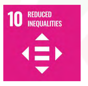
SDG 10: Reduce inequality within and among countries

While SDG 5 places an emphasis on the empowerment of women and girls, it is equally relevant to people of diverse SOGIESC. A more inclusive understanding of gender to include the experiences of lesbian, bi, trans and intersex people will contribute to the transformative promise of the SDGs.